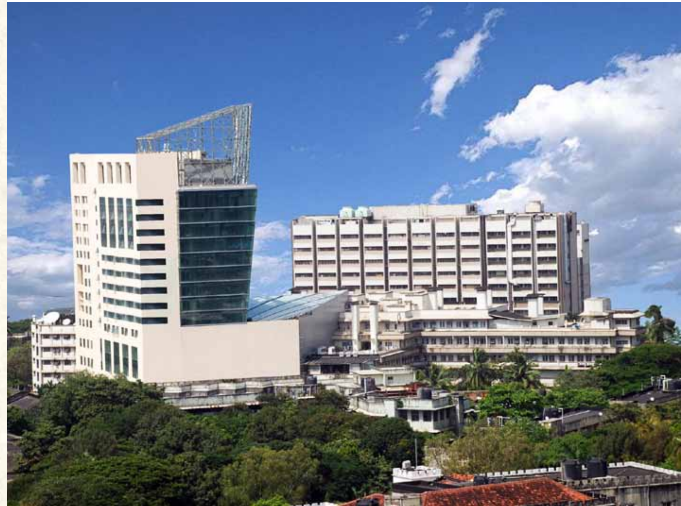
Tata Memorial Hospital MUMBAI, INDIA

Tata Memorial Hospital is an autonomous body under the Department of Atomic Energy. It is India's premier cancer treatment, education and research centre and among the biggest cancer centers in the whole world. It registers more than 35,000 new cancer patients every year and another 25,000 patients come in for second opinion.