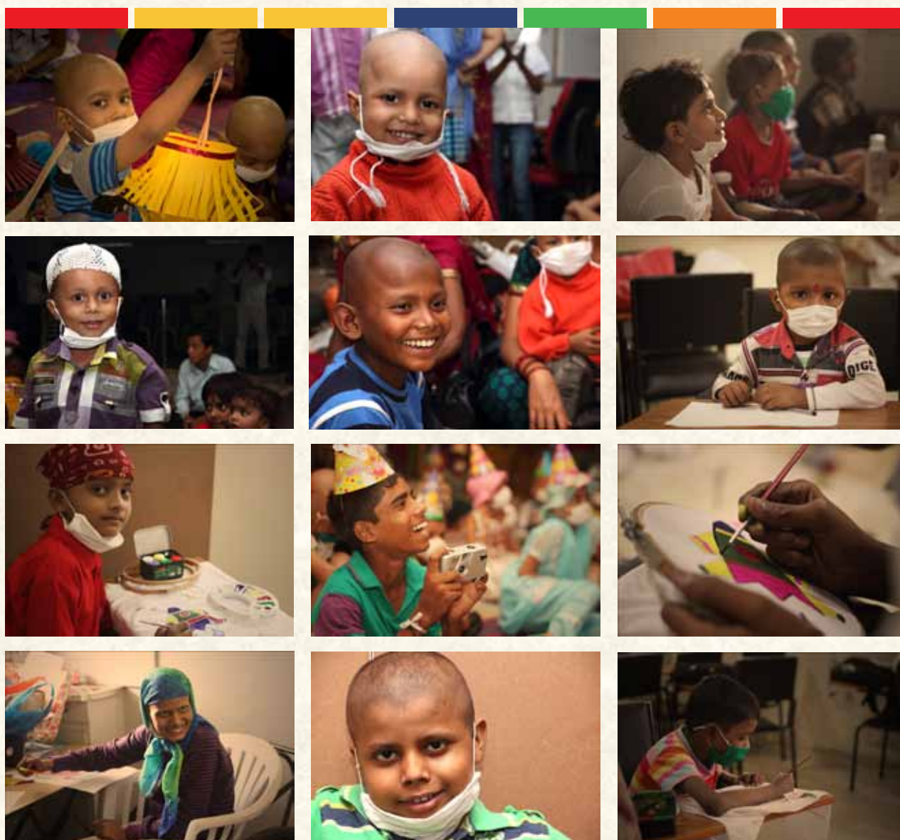
This is dummy text, this is to be replaced with actual text

We strive to give the same quality of treatment to all patients, irrespective of the category of the patients registered at the hospital (private or general). The infrastructure provided by the hospital is the same for all patients. However, 70% belong to low socio-economic strata and need immense support for treatment.